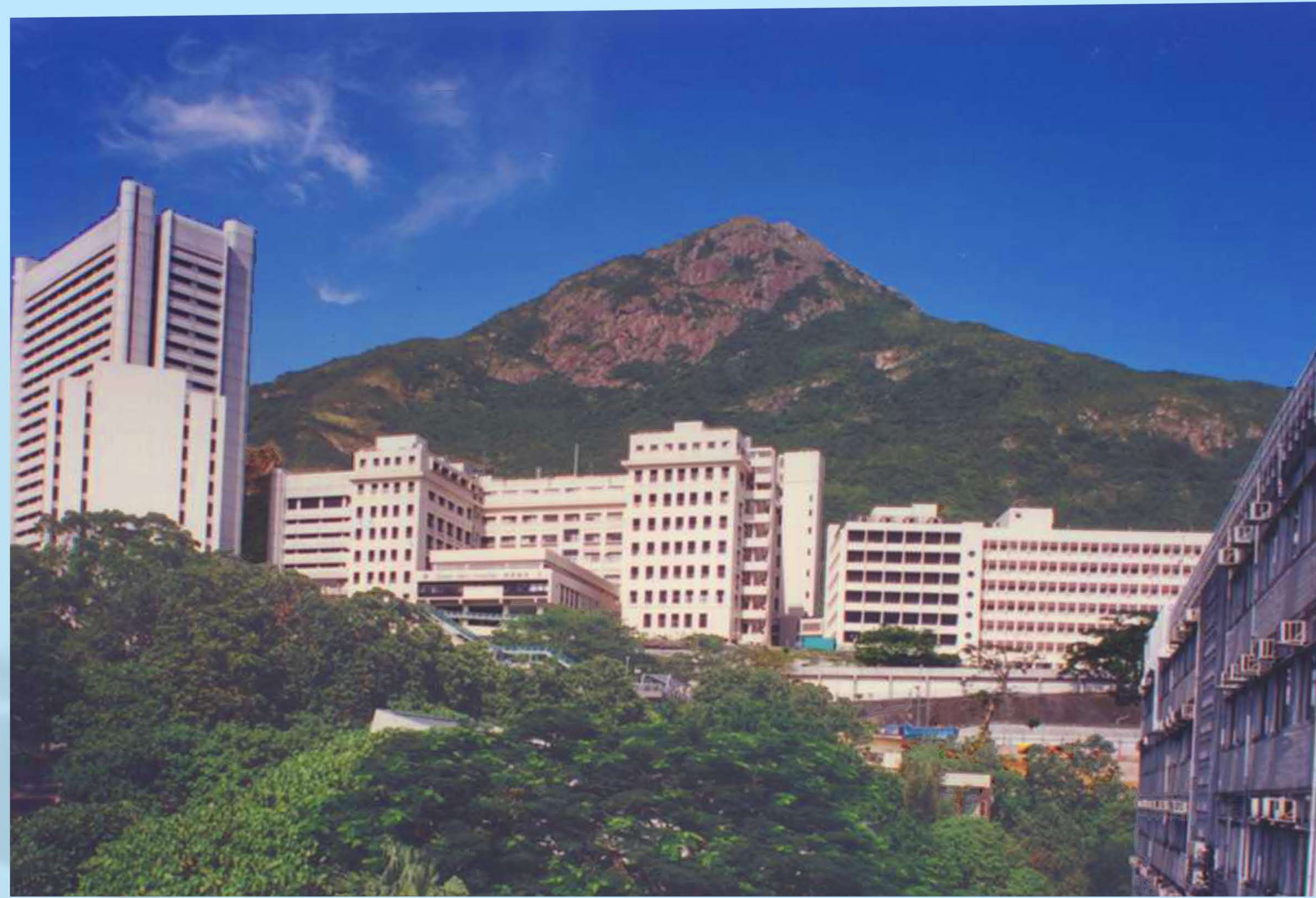
Li Shu Fan Building (foreground) and the Queen Mary Hospital