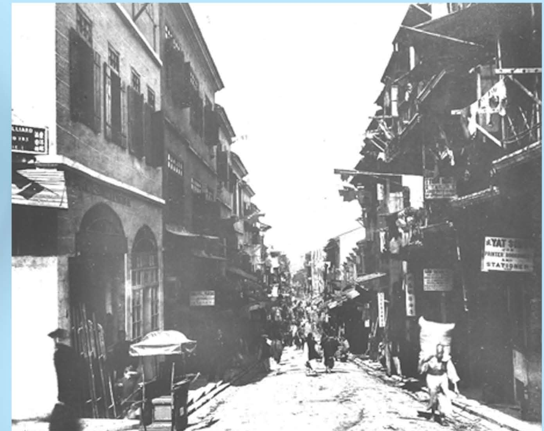
Hong Kong College of Medicine for Chinese

The origin of the medical library dated back to 1887 with the founding of the Hong Kong College of Medicine for Chinese. A medical library was set up as part of the facilities of the College.