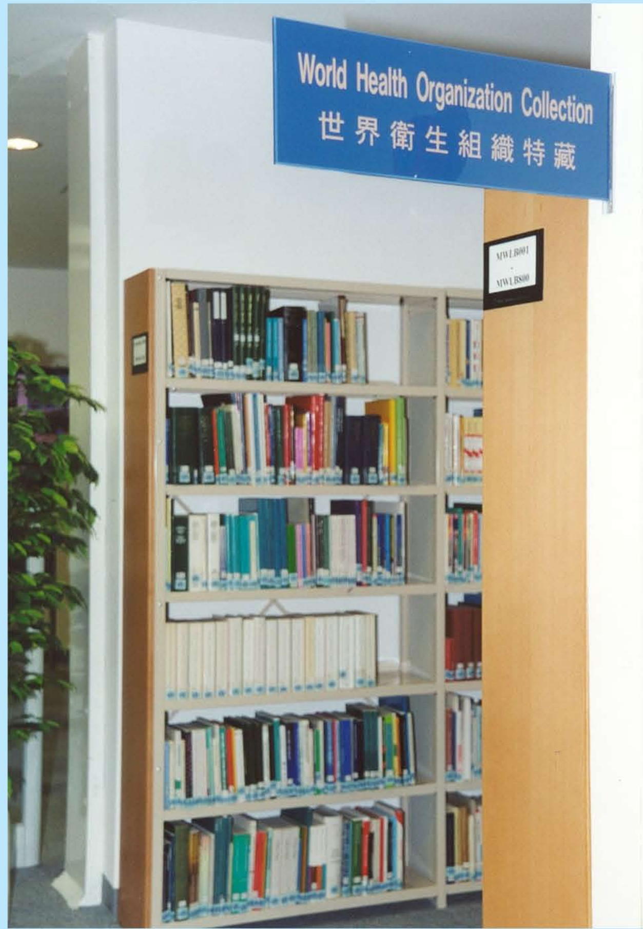
World Health Organization Collection

Medical Library received the honour of being designated as depository for World Health Organization publications.