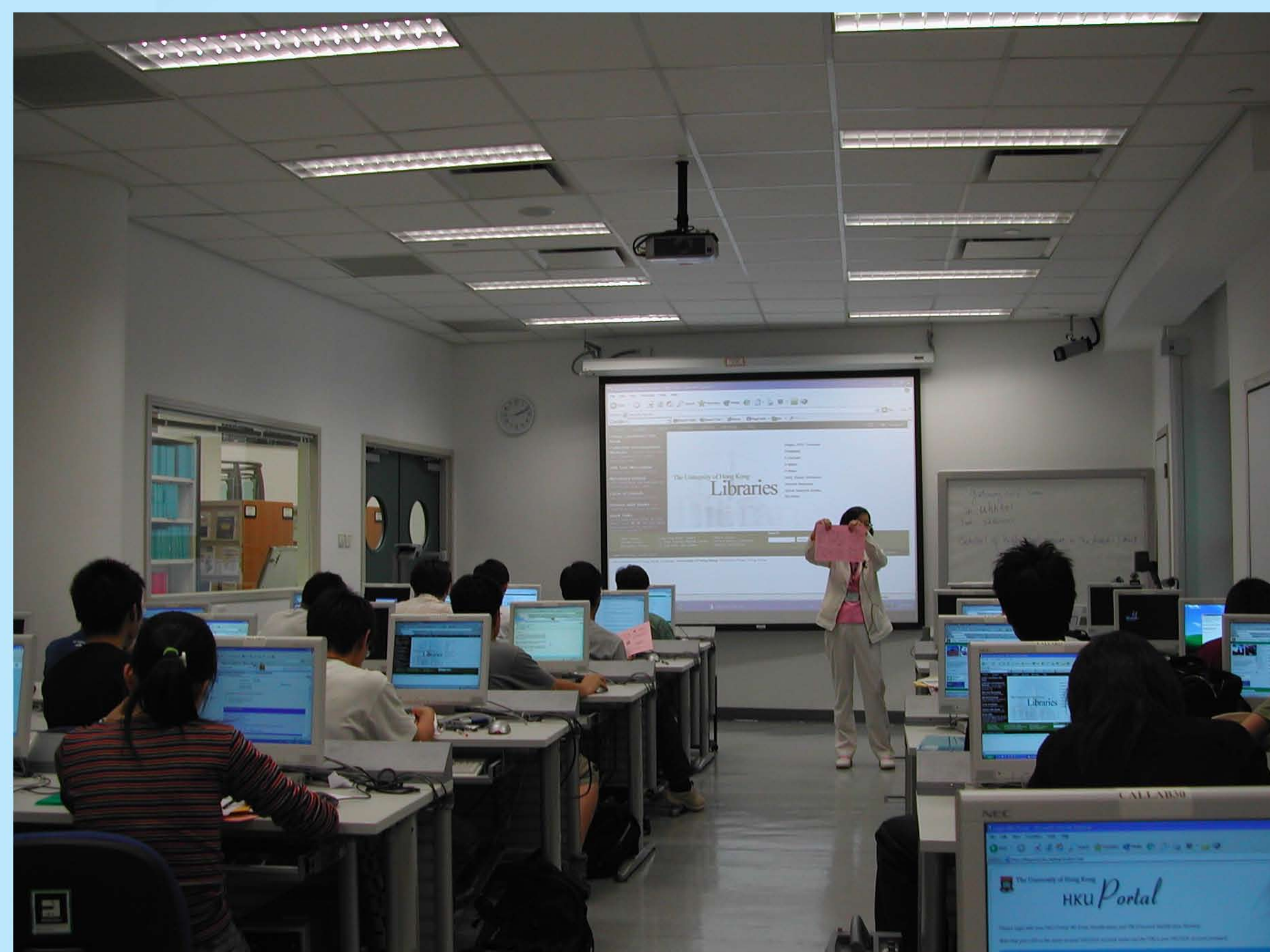
Computer assisted learning laboratory

A Computer Assisted Learning Laboratory was set up to provide modern information technology and resources for teaching and learning.