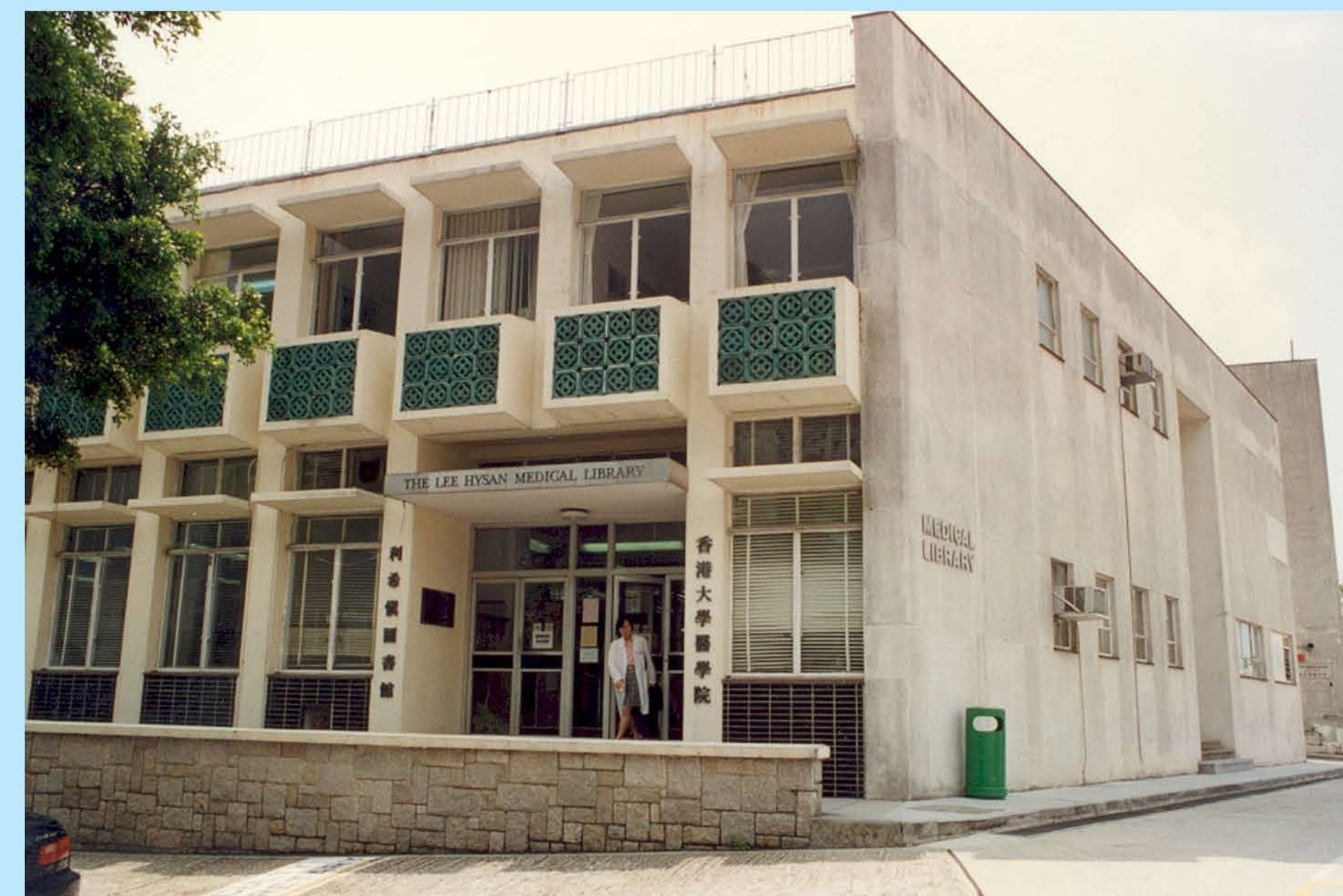
Lee Hysan Medical Library