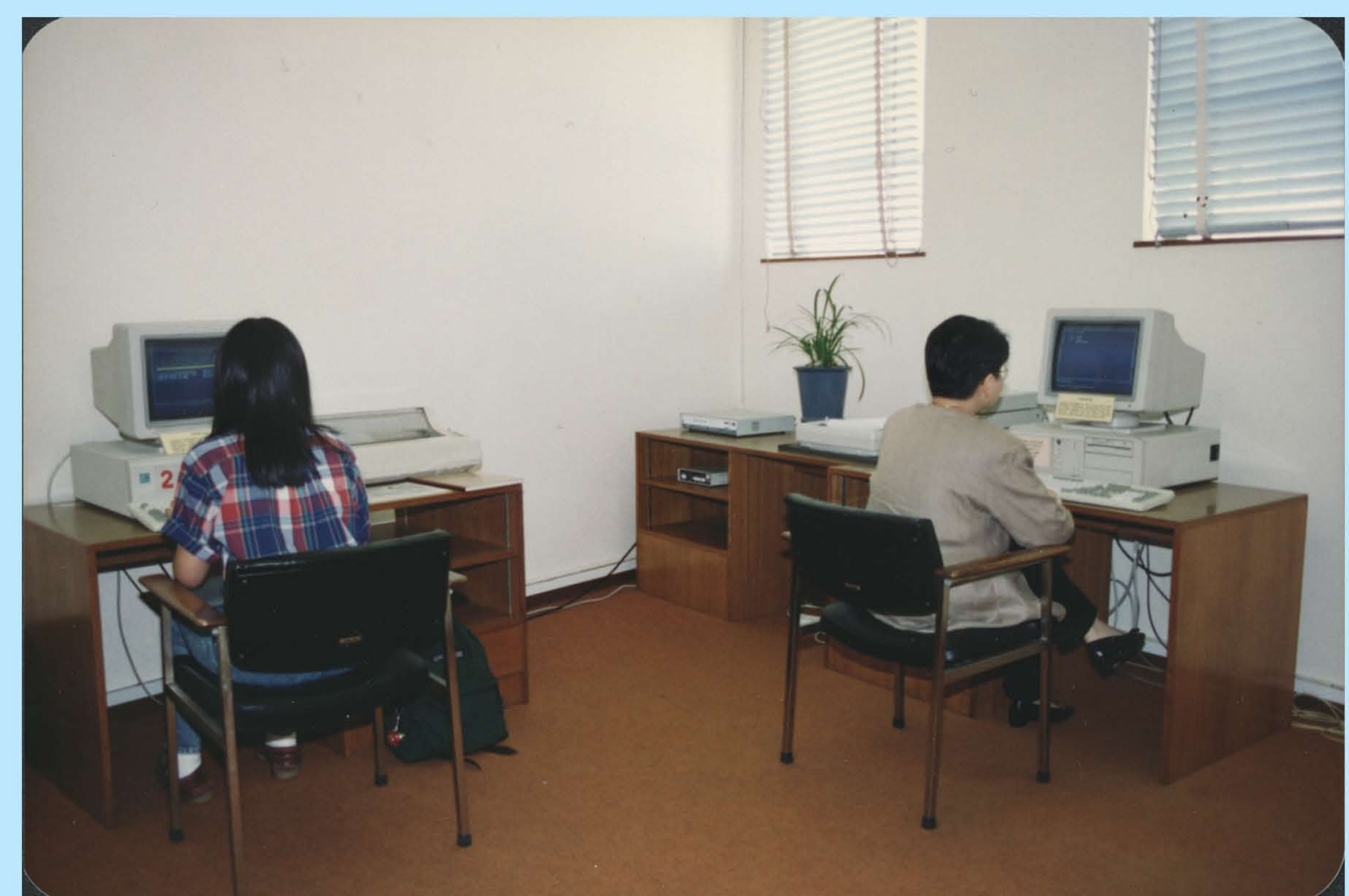
Searching MEDLINE database