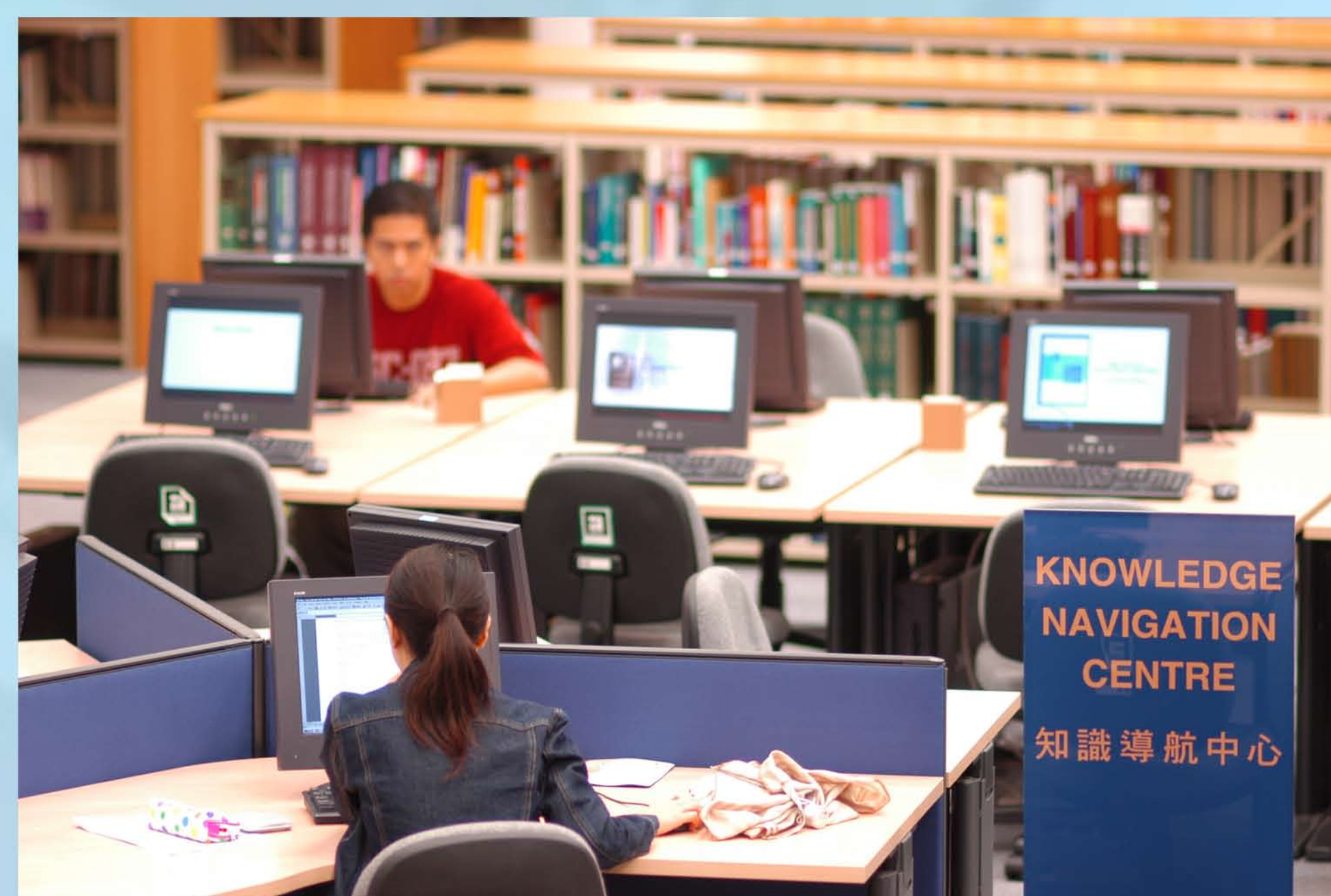
Knowledge Navigation Centre

The Knowledge Navigation Centre was continuously expanded and equipped with the latest hardware and software to integrate studying, research and digital publishing. E-video workstations were installed to allow media streaming over the Internet from Main Library.