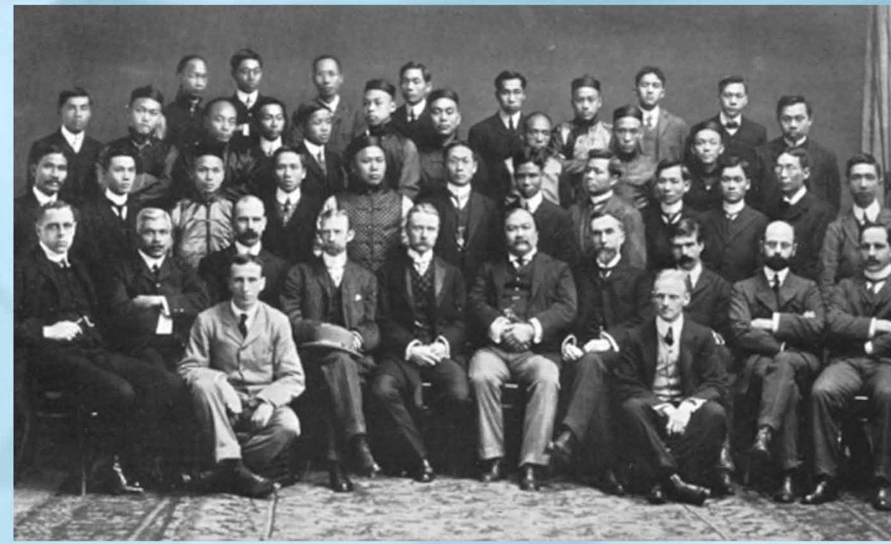
Staff and students of the Hong Kong College of Medicine for Chinese in 1908