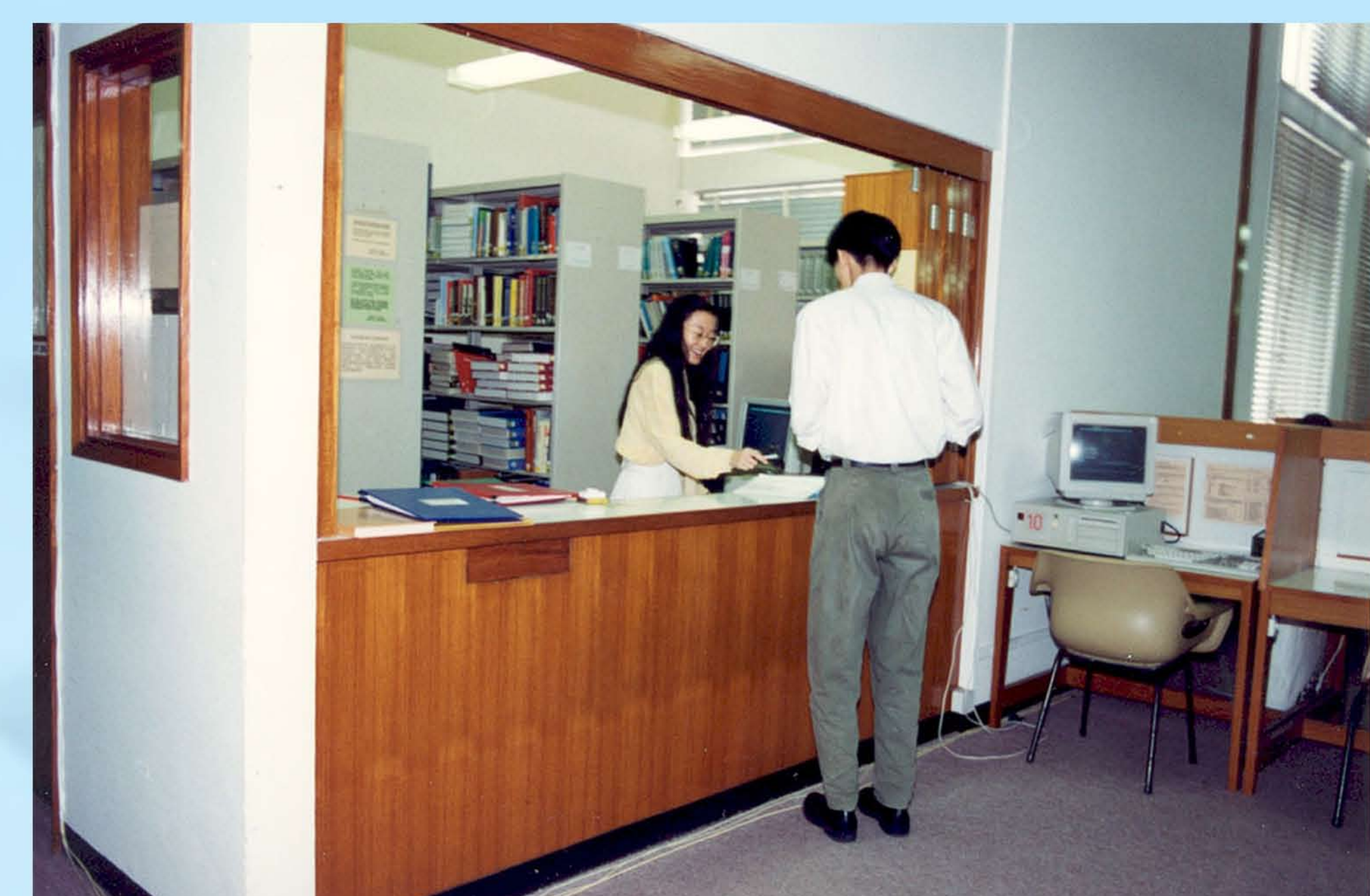
Reserve Book Room