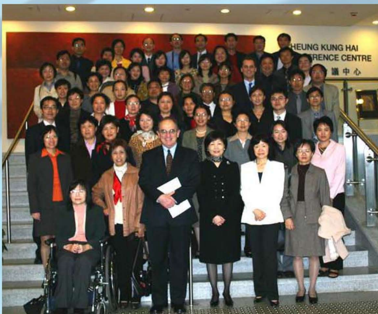
Library Directors at the Library and Information Services in Health Sciences Libraries Seminar

The Library and Information Services in Health Sciences Libraries Seminar co-organized in 2004 by Yu Chun Keung Medical Library and Ovid Technologies brought together, for the first time, health sciences librarians and directors from different regions of China and Taiwan in an open forum in Hong Kong.