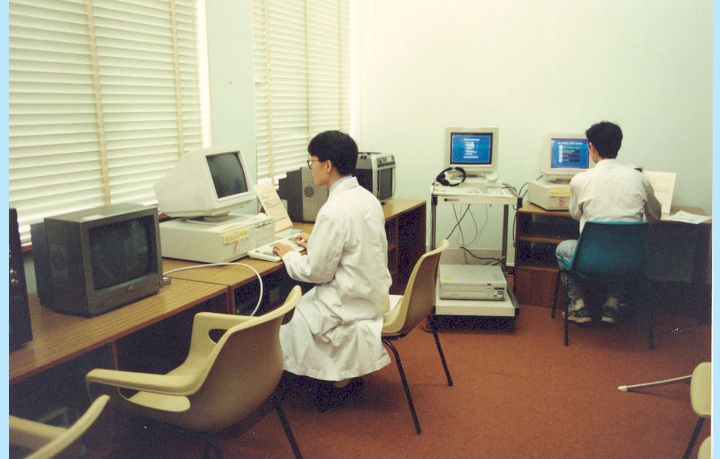
Electronic Information Centre

1989 DRA system, an integrated library automation system, was implemented to provide online access to records of post-1980 medical books.