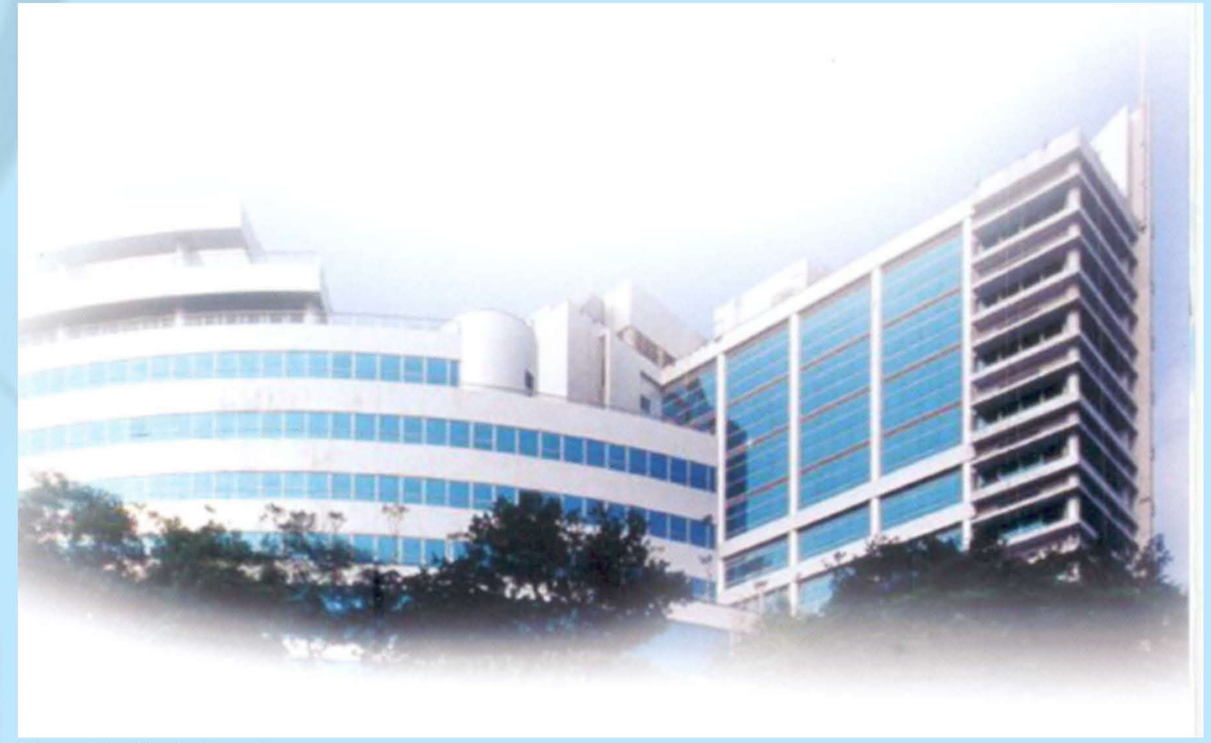
New Medical Complex

Initial planning of the new Medical Complex and medical library in Sassoon Road commenced.