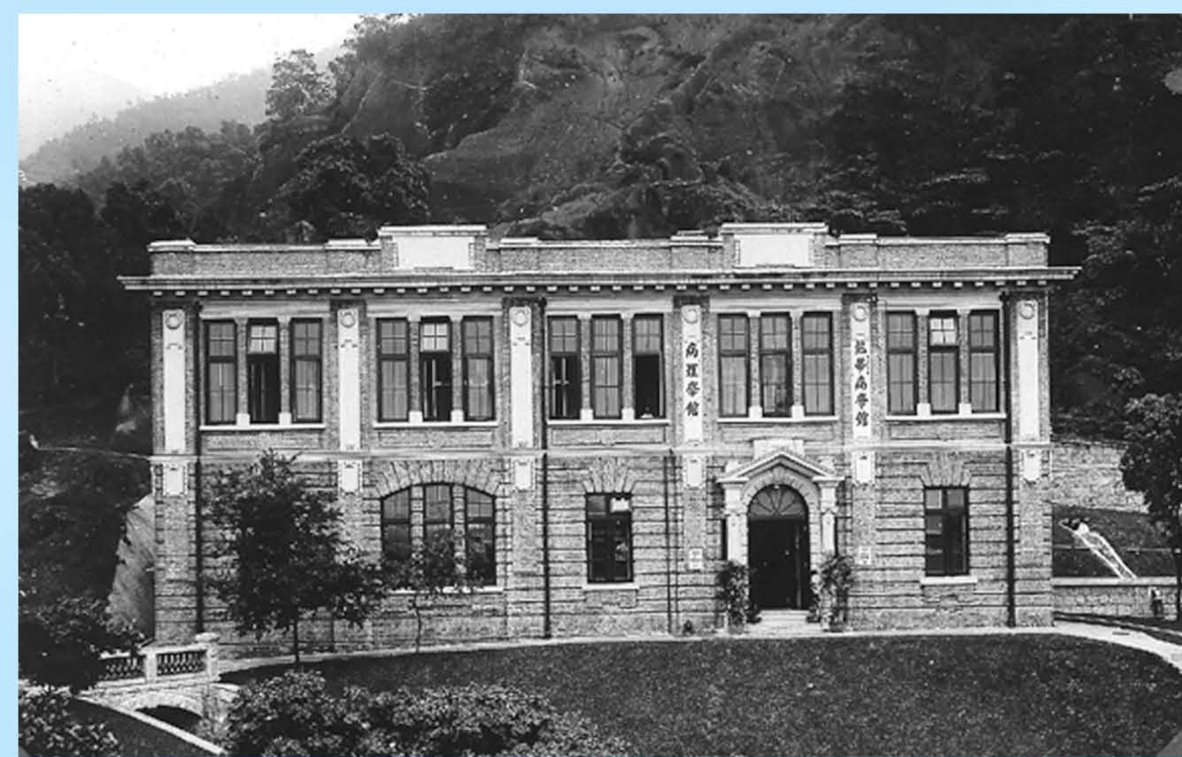
The School of Tropical Medicine and Pathology in 1919

By the end of World War I, at the request of the Medical Faculty, part of the medical collection was transferred to the Department of Pathology and Bacteriology in Queen Mary Hospital, occupying a floor area of 1,130 sq. ft.