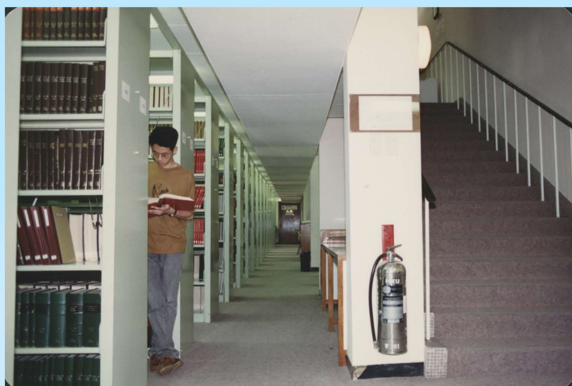
Student browsing the journal collection