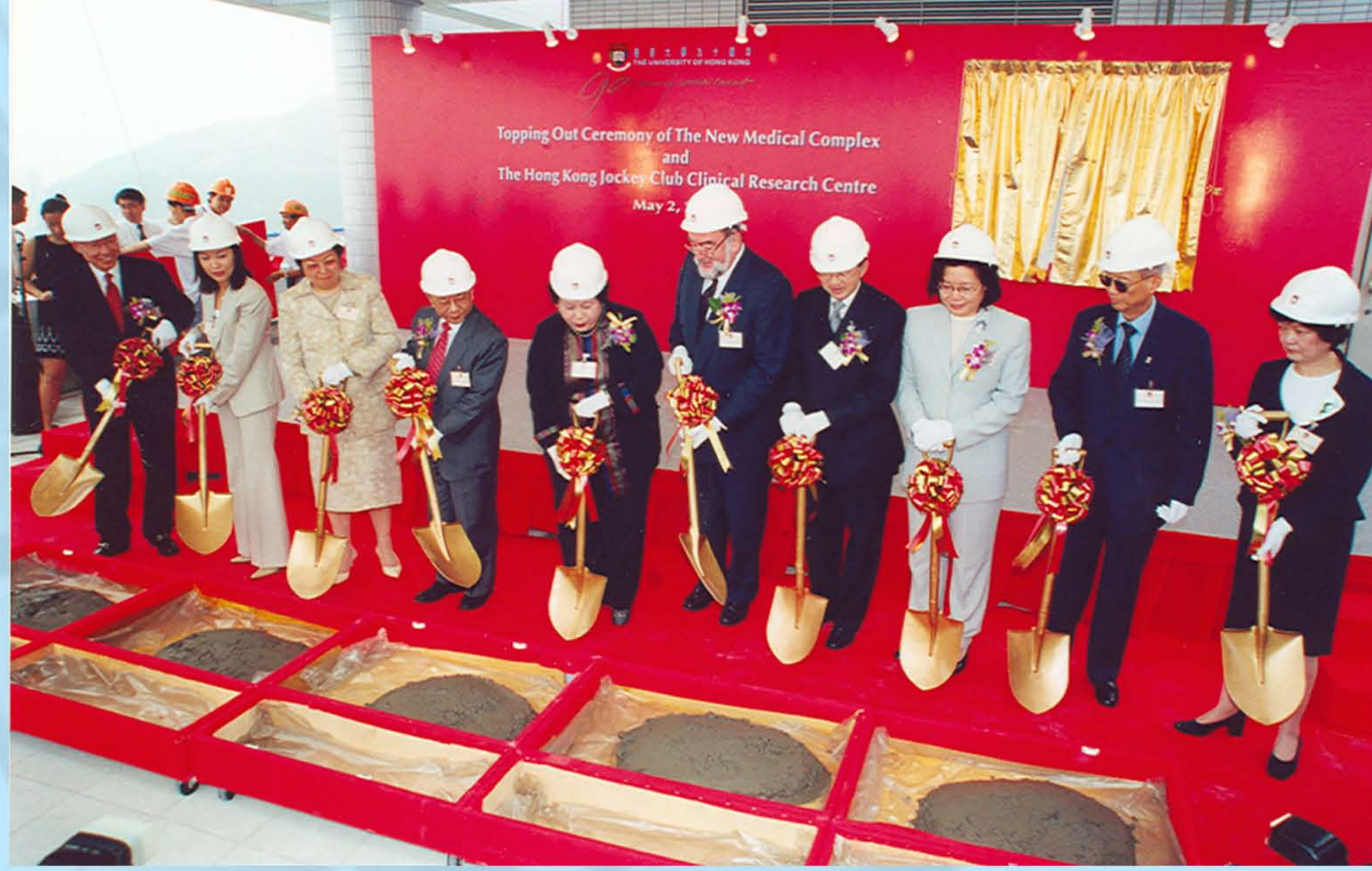
New Medical Complex topping out ceremony