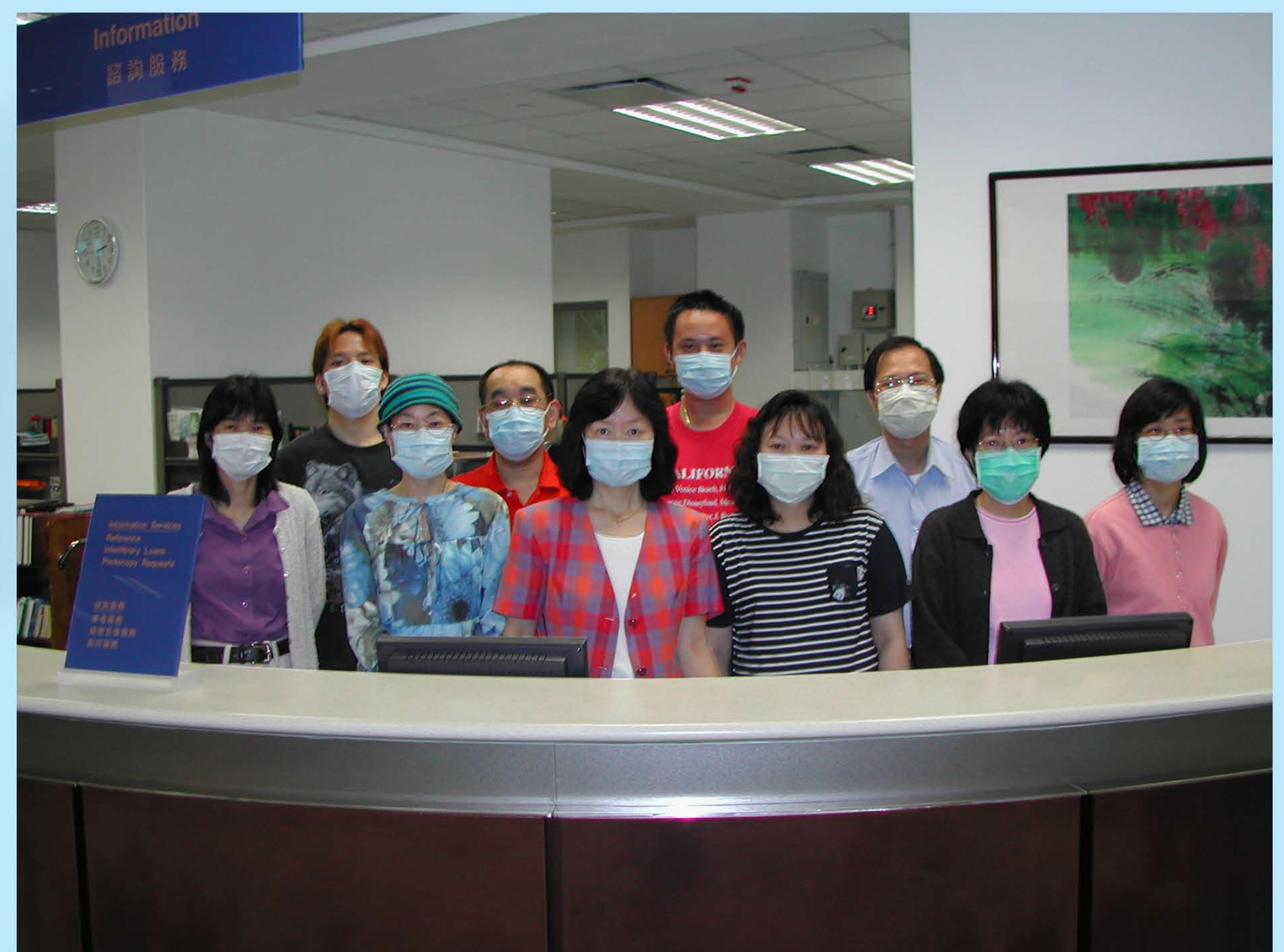
Medical Library staff geared up to combat SARS