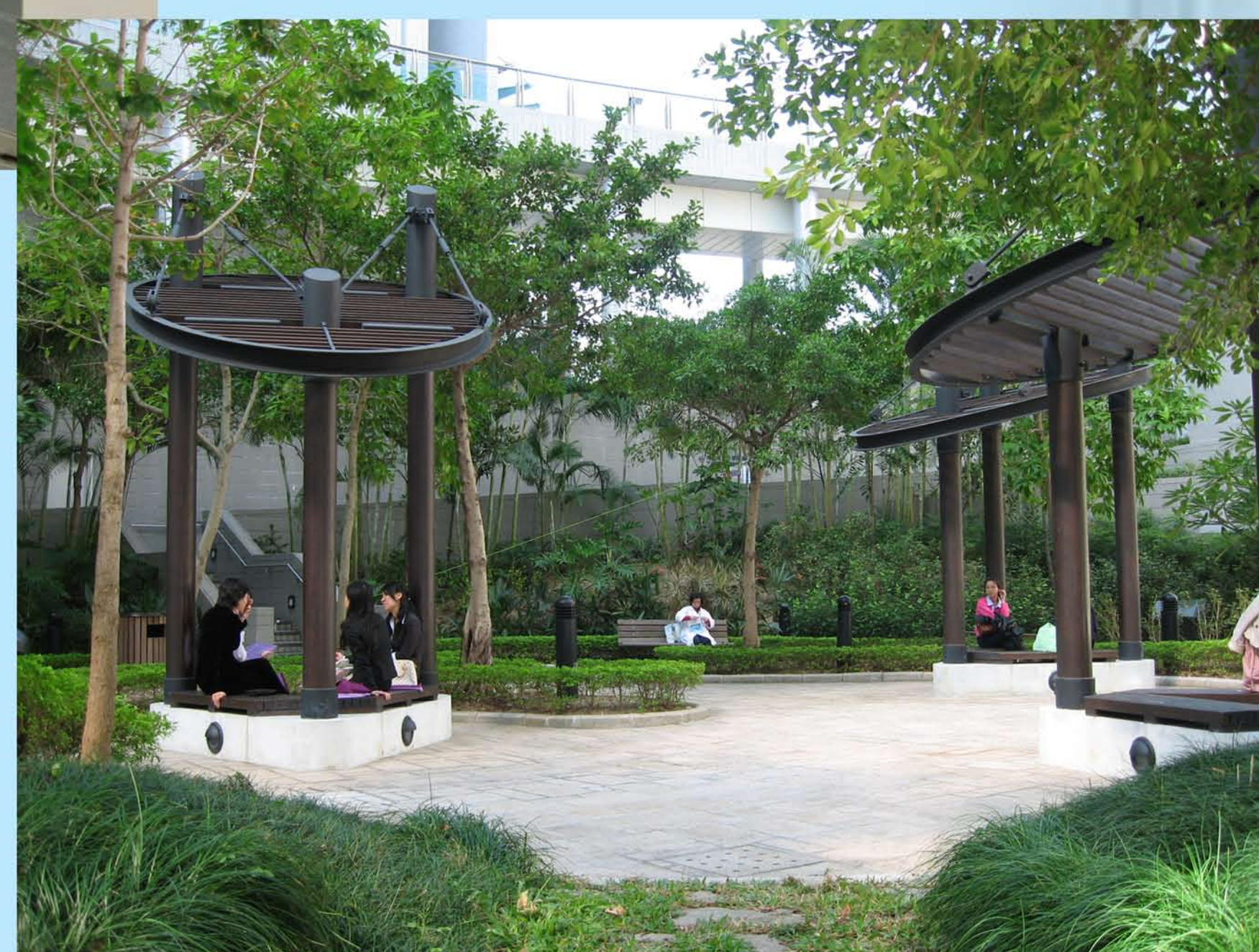
The garden outside the Medical Library as part of the Learning Commons