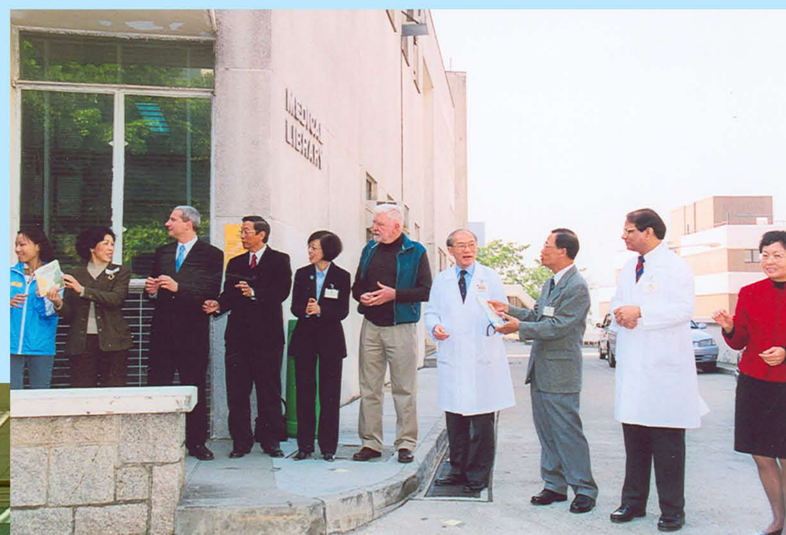
Staff's human chain in the Book Passing Ceremony

To celebrate the opening of the new Medical Library, medical and nursing staff/students formed the record-breaking human chain and participated in the Book Passing Ceremony, passing the last batch of books from the old to the new library, signifying "Moving into the New Era and the Continuous Efforts of Cultivating Medical Elites in the future".