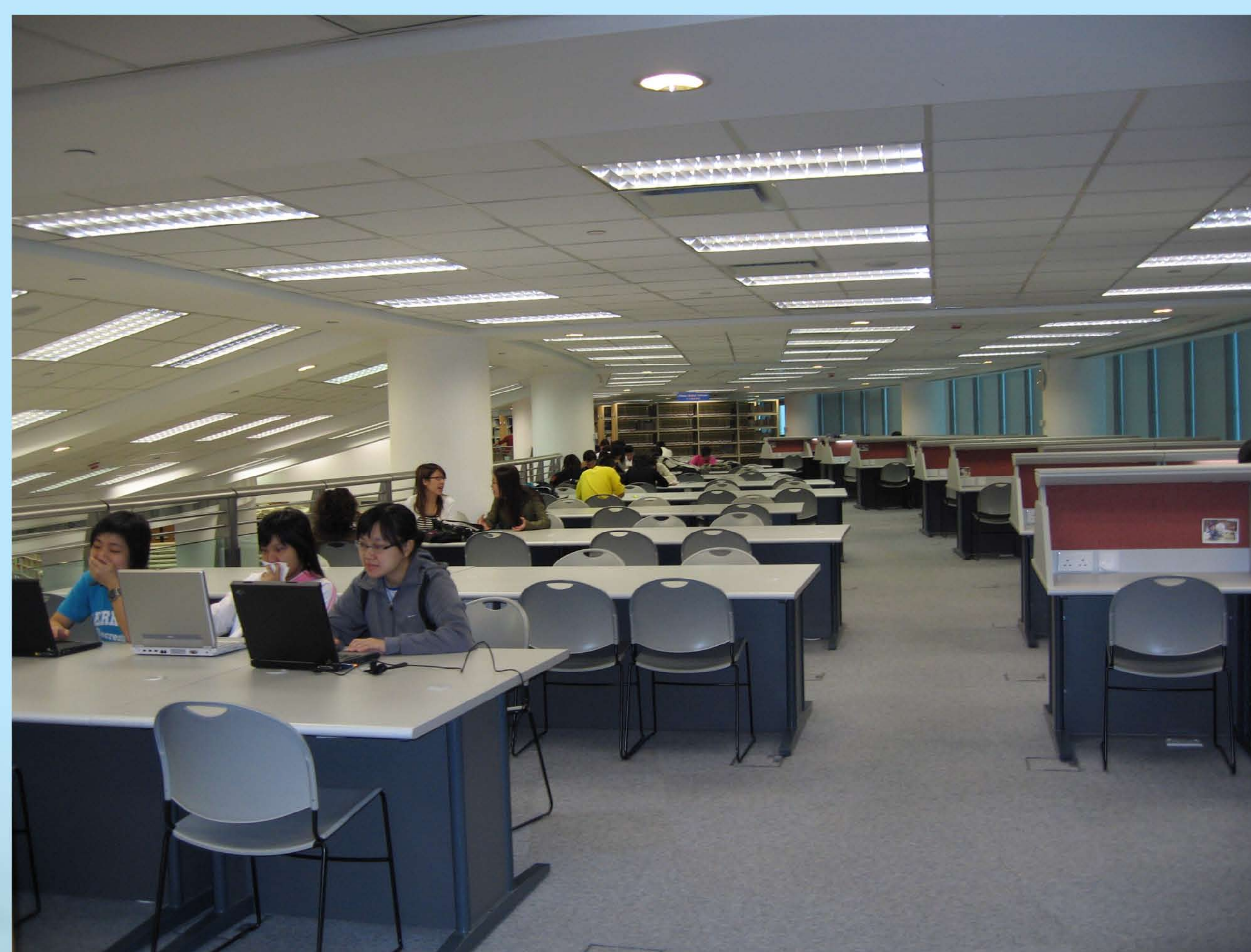
Reading area with wireless LAN access

The Knowledge Navigation Centre was continuously expanded and equipped with the latest hardware and software to integrate studying, research and digital publishing. E-video workstations were installed to allow media streaming over the Internet from Main Library.