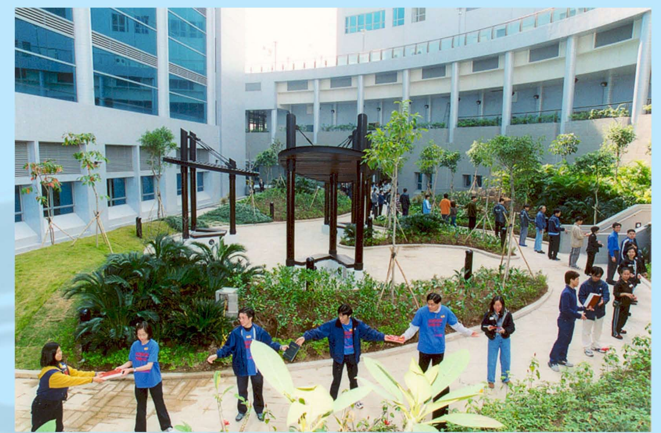
Students' human chain in the Book Passing Ceremony