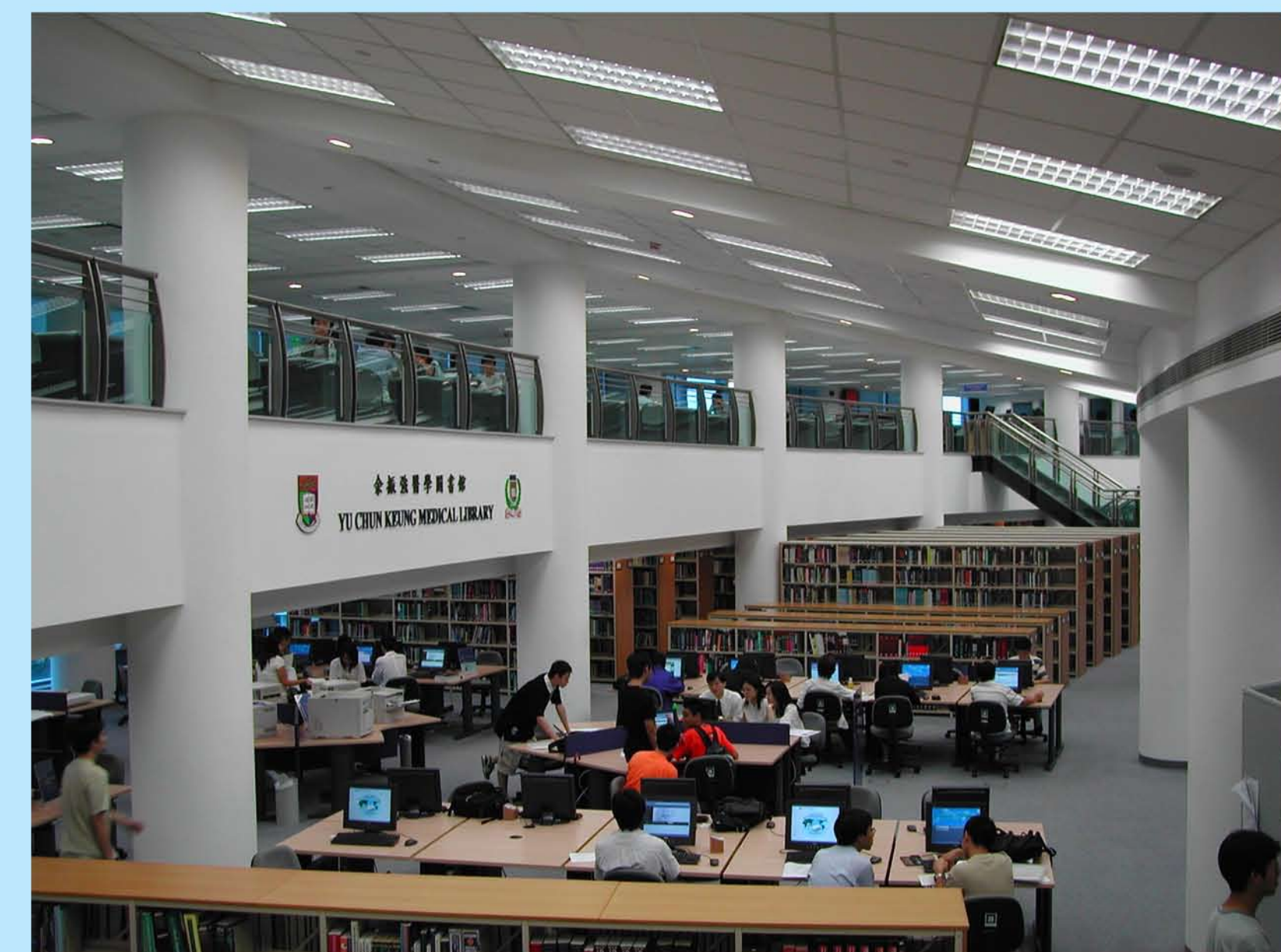
Yu Chun Keung Medical Library overview

To celebrate the opening of the new Medical Library, medical and nursing staff/students formed the record-breaking human chain and participated in the Book Passing Ceremony, passing the last batch of books from the old to the new library, signifying "Moving into the New Era and the Continuous Efforts of Cultivating Medical Elites in the future".