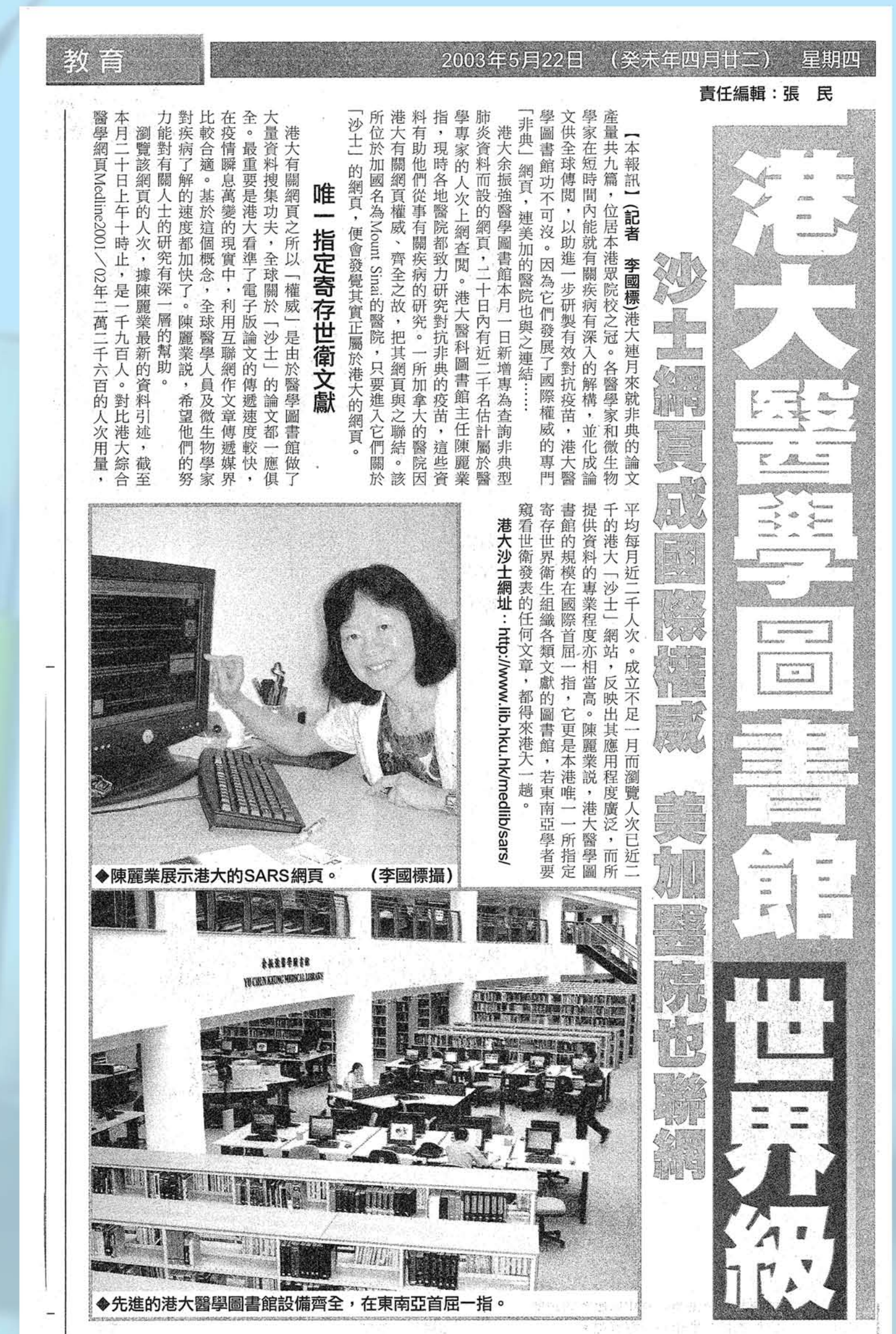
Excerpt from the newspaper 香港文匯報

Medical Librarian's interview with Wenwei newspaper (香港文匯報) after the new Medical Library was opened.