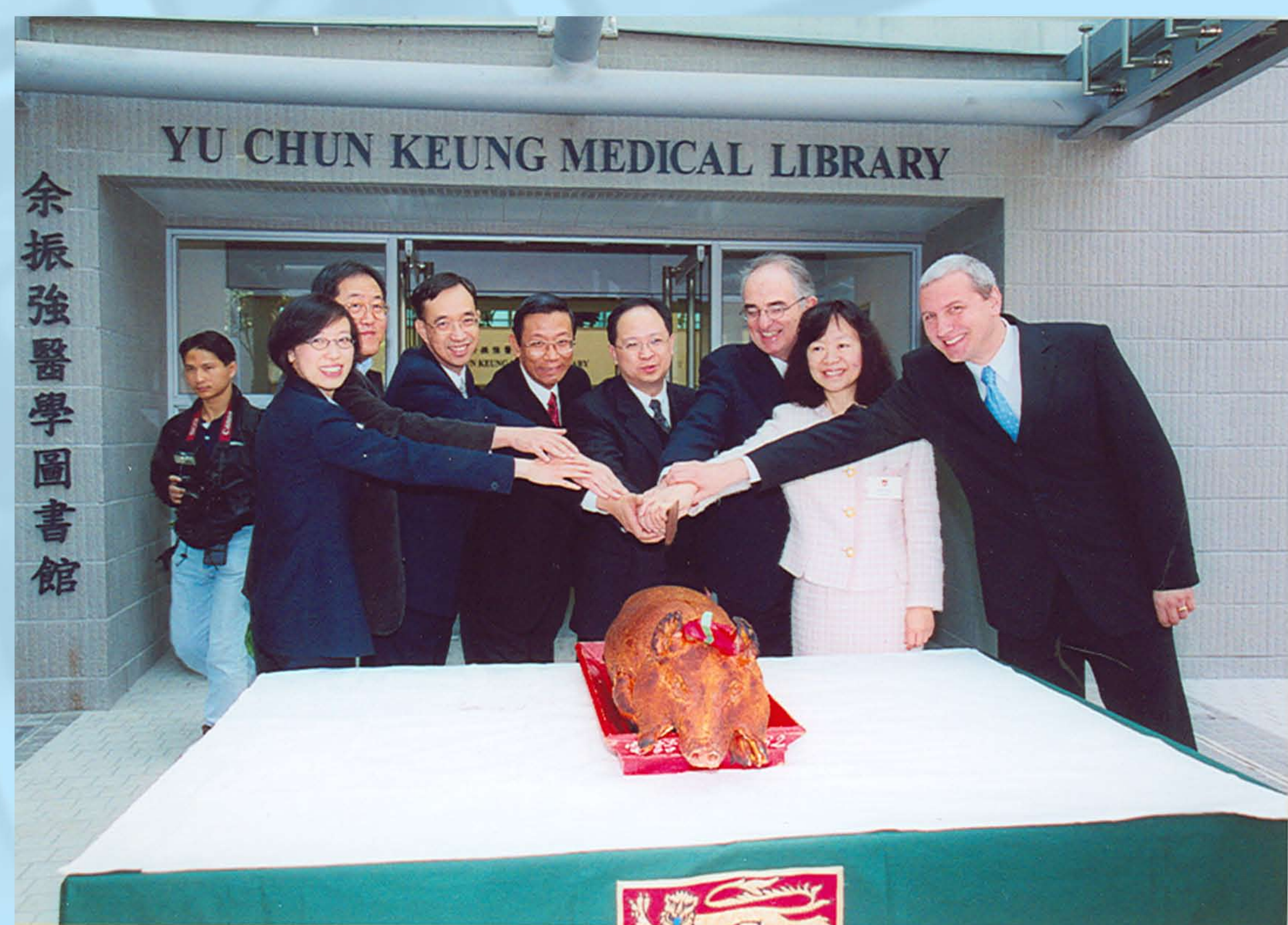
Cutting up the Roast Pig in celebration of the new Library

The Lee Hysan Medical Library moved into the new Medical Complex and renamed as Yu Chun Keung Medical Library in memory of the generous support of the late Mr Yu Chun Keung. The new library has a total area of 2,850 sq. m.