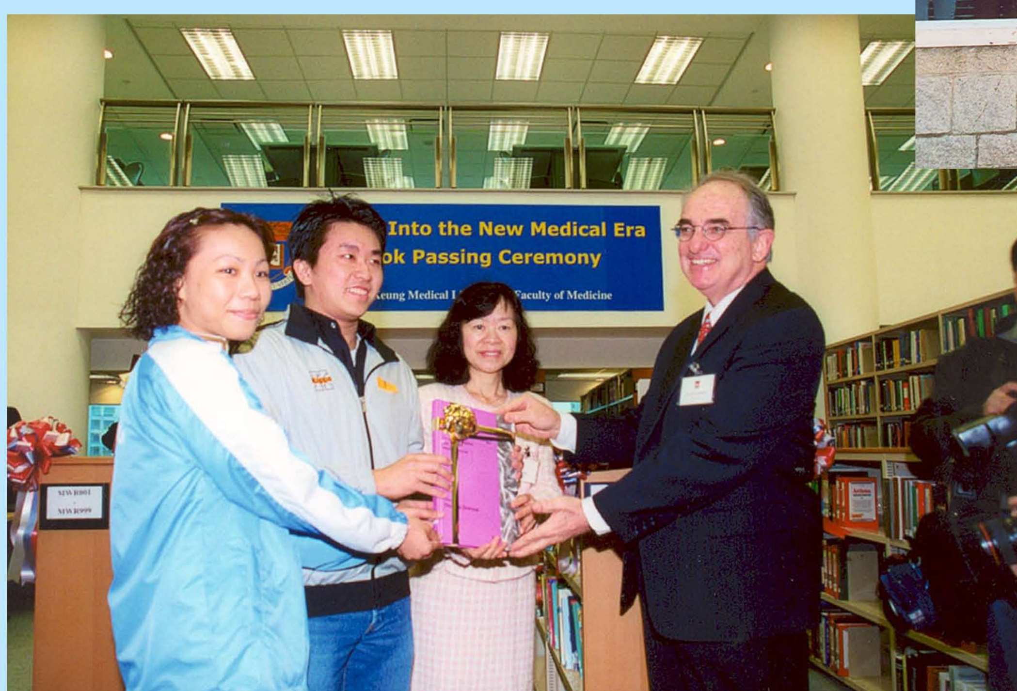
Book Passing Ceremony