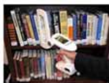
Digital Library Assistant