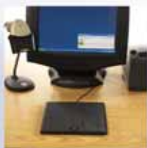
Pad Staff Workstation