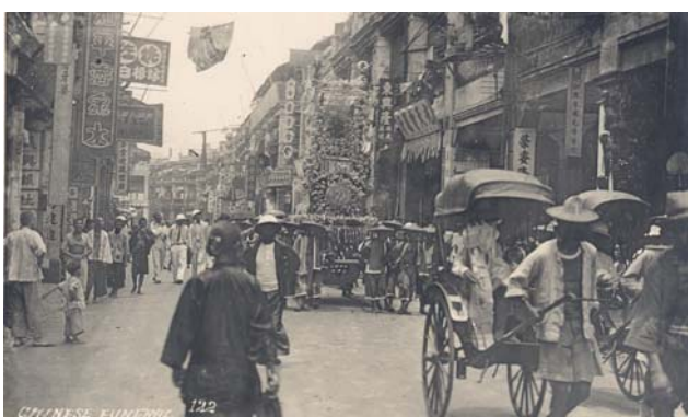
皇后大道西近東邊街之送殯行列，約 1925 年。 Funeral Processions in Queen's Road West, near Eastern Street, c.1925.