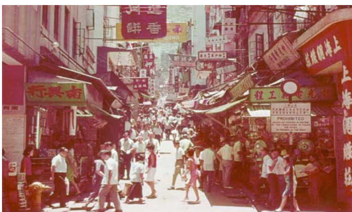
同上，1965 年。 Same as the above, 1965.