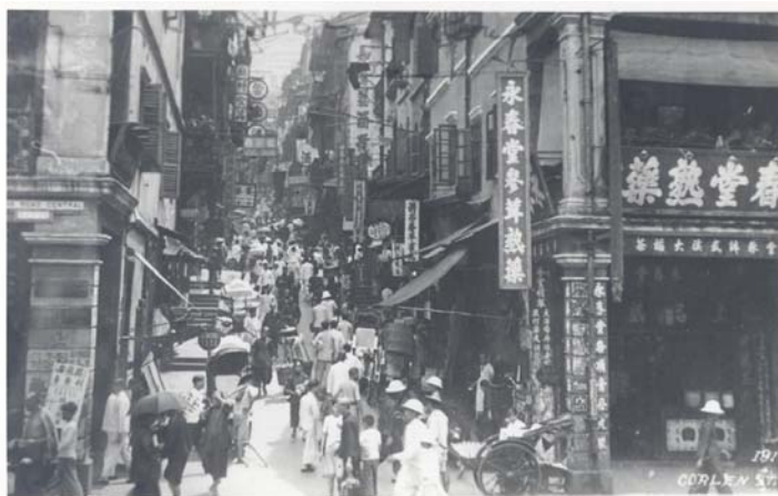
由皇后大道中望閣麟街，約 1935 年。 Cochrane Street, from Queen's Road Central, c.1935.