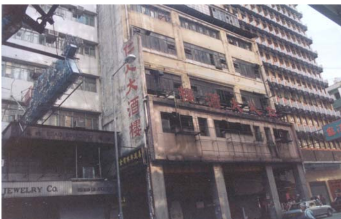
皇后大道中接近鴨巴甸街的仁人酒樓，約 1992 年。 Yan Yan Chinese Restaurant, Queen's Road Central near Aberdeen Street, c. 1992.