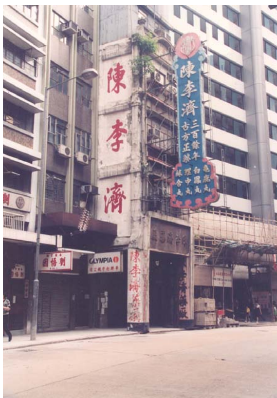
皇后大道中近「二奶巷」(安和里)的藥廠，1992年。 A Chinese Medicine factory of Queen's Road Central, near On Wo Lane, 1992.