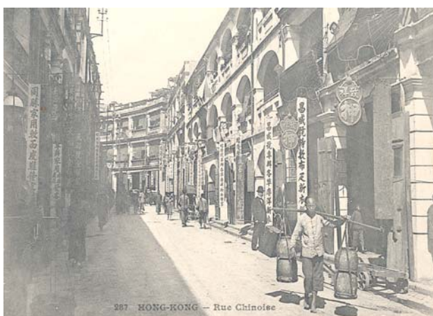
接近水坑口街的皇后大道西，約 1900 年。 Queen's Road West, near Possession Street, c.1900.