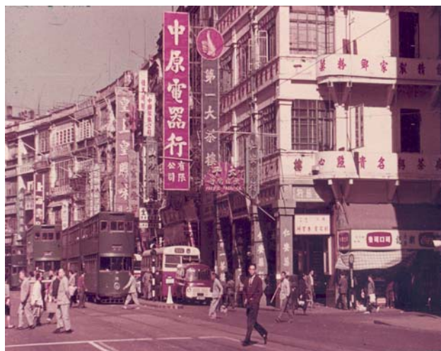
由中環街市西望德輔道中，約 1958 年。 Des Voeux Road Central, looking from Central Market, c.1958