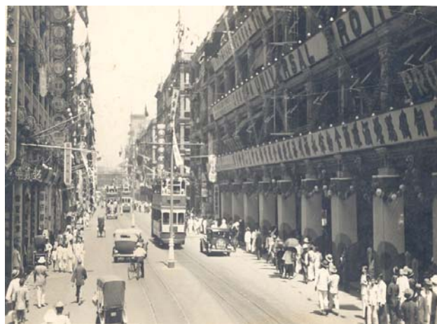
德輔道中的永安公司，約 1935 年。 Wing On Co. of Des Voeux Road Central, c.1935.