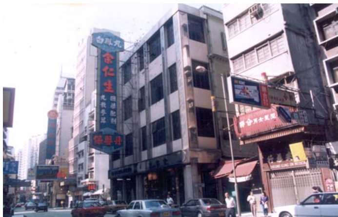
接近卑利街的皇后大道中，1992年。 Queen's Road Central, near Peel Street, 1992.