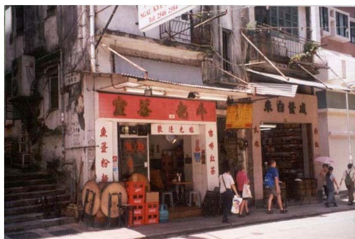
位於士丹頓街的茶室和米鋪，1989年。 Tea House and Rice Shop of Staunton Street, 1998.