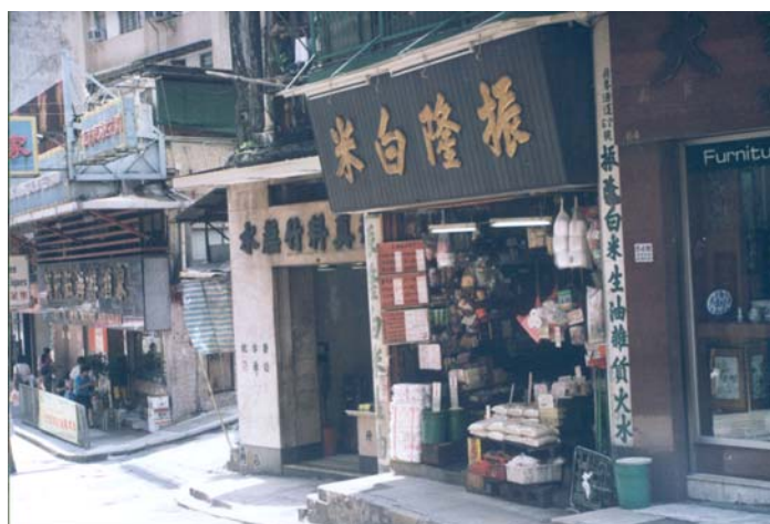
接近卑利街的荷李活道，1992年。 Hollywood Road, near Peel Street, 1992.