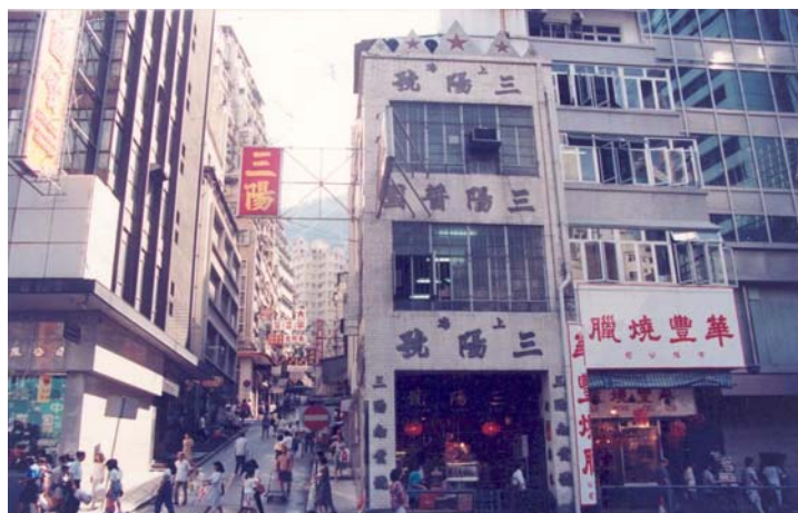
同上，1989 年。 Same as above, 1989.