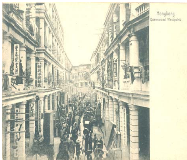
由威利麻街東望皇后大道西，約 1905 年。 Queen's Road West, looking east from Wilmer Street, c.1905.