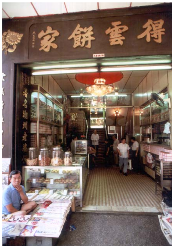
約 1970 年的得雲茶樓。 Tak Wan Tea House, c.1970.