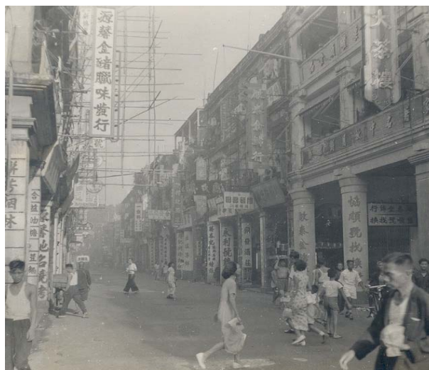
由正街望皇后大道西，約 1953 年。右方為多男茶樓。 Queen's Road West, looking from Centre Street, c. 1953. Dor Nam Tea House is on the right.