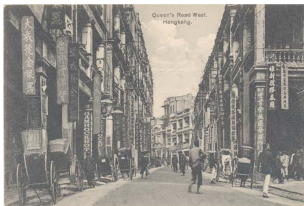
由急庇利街西望皇后大道中的老店，約 1915 年。 The old shops of Queen's Road Central, looking west from Cleverly Street, c.1915.