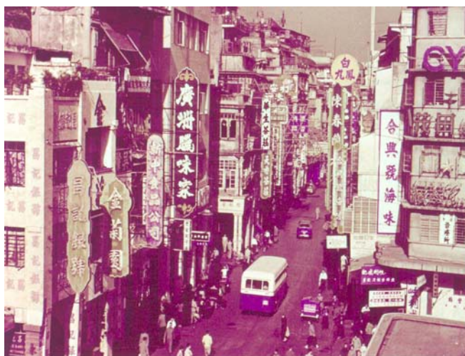
由中環街市西望皇后大道中，約 1958 年。 Queen's Road Central, looking west from Central Market, c.1958.