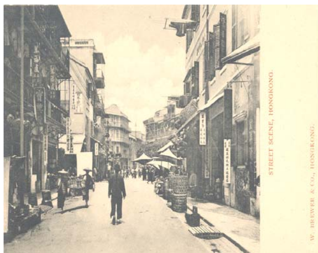
接近摩利臣街的永樂街，約 1905 年。 Wing Lok Street, near Morrison Street, c.1905.