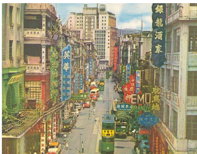
由西港城望德輔道中，約 1964 年。 Des Voeux Road Central, from Western Market, c.1964.