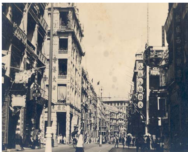
界乎德輔道中與永和街間的先施公司，約 1930 年。 Sincere Co. of Des Voeux Road Central and Wing Wo Street, c.1930.