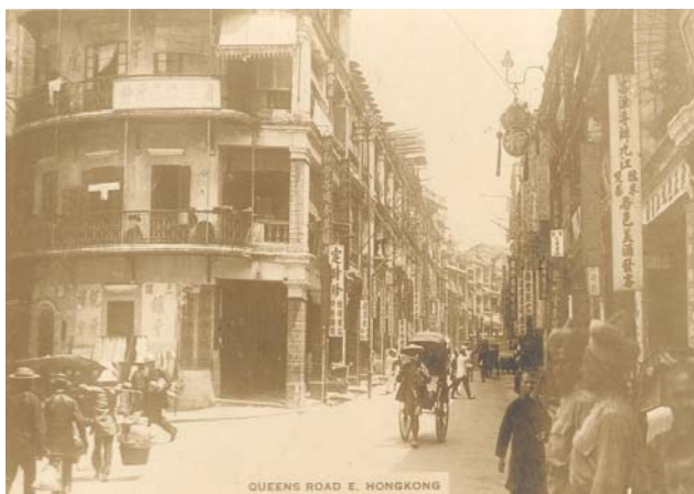
由水坑口街東望皇后大道中，約 1908 年。 Queen's Road Central, looking east from Possession Street, c.1908.