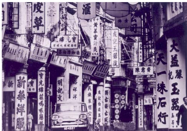
皇后大道中近孖沙街的老店，約 1964 年。 Old shops of Queen's Road Central, near Mercer Street, c.1964.