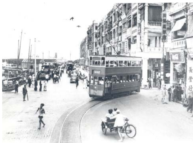
干諾道中與急庇利街間的老店，約 1949 年。 Old shops between Connaught Road Central and Cleverly Street, c. 1949.