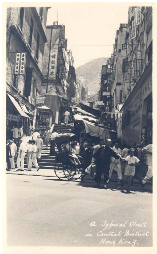
由皇后大道中望砵甸乍街，約 1950 年。 Pottinger Street from Queen's Road Central, c.1950.