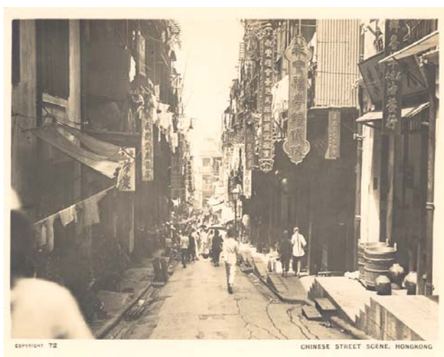
由太平山街下望東街，約 1925 年。 Tung Street, looking from Tai Ping Street, c.1925.