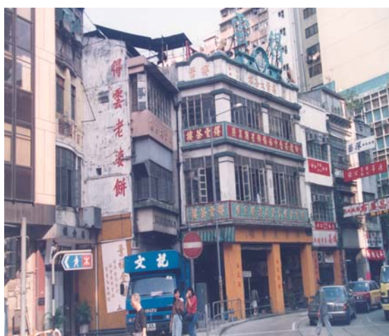
位於皇后大道中與文咸東街間的得雲茶樓，1992 年。 Tak Wan Tea House, of Queen's Road Central and Bonham Strand East, 1992.