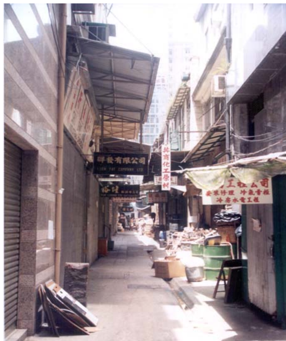
化工原料街 – 同文街，1992 年。 Chemical Street – Tung Man Street, Central 1992.