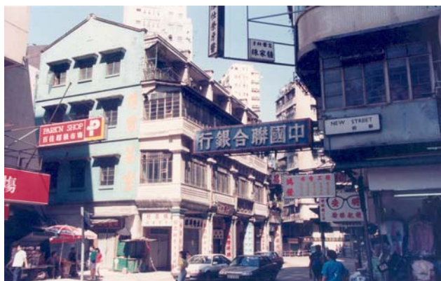
位於皇后大道西與和風街間的得男茶室，1989 年。 Tak Nam Tea House situated between Queen's Road West and Wo Fung Street, 1989.