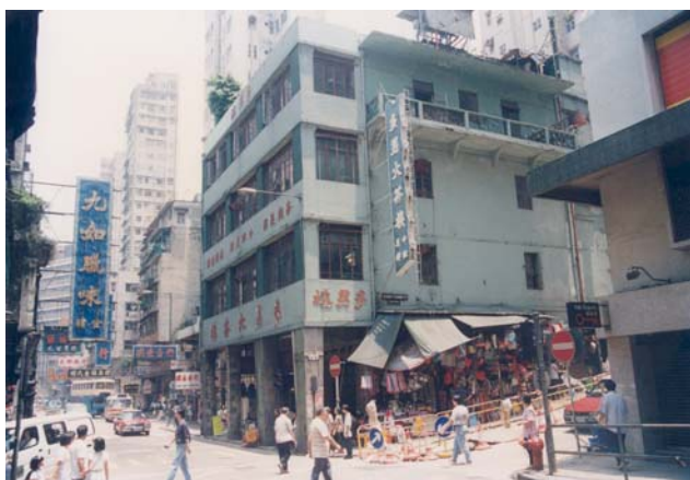
同一地點，1989 年。 The same place, 1989.