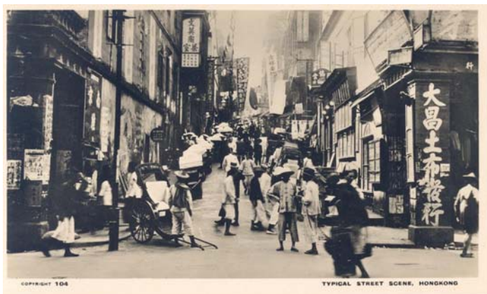
皇后大道中望卑利街，約 1925 年。 Peel Street, looking from Queen's Road Central, c.1925.