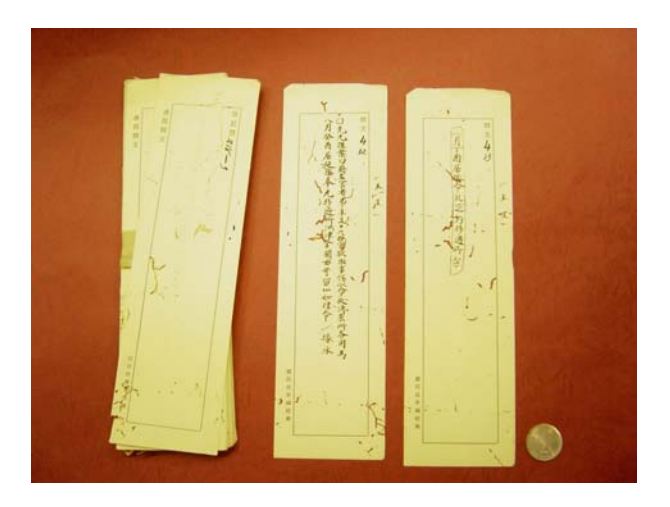
圖四:漢簡釋文紙籤[27.3 x 8公分], 內框[5.2 x 23.5公分]

正面方框為釋文,內為墨書。框左下方印有:"團員貝格滿 採集"七字,貝格滿即Folke Bergman。背面框外左上印" 漢簡釋文"左下印:"西北科學考查團"七字。框內右端 印:"登記號"參字,其下即為墨書的登記號碼。誌錄採得 之地方包括 Taralingin Durbeljin, Watchtower 1 li N.of Ulan Durbeljin, 阿敵克擦可汗,雙城子、北大河 Boro tsonch, Bukhen torej, Ulan durbeljin, Tsonchein ama, Khara khoto,有些為木檢、或木皮,部份更繪有木皮之形 狀,當中亦有未具名稱及無登記號之者。另有三大扎題為 Ulan durbeljin 不印之件釋文簽,共1024 張。