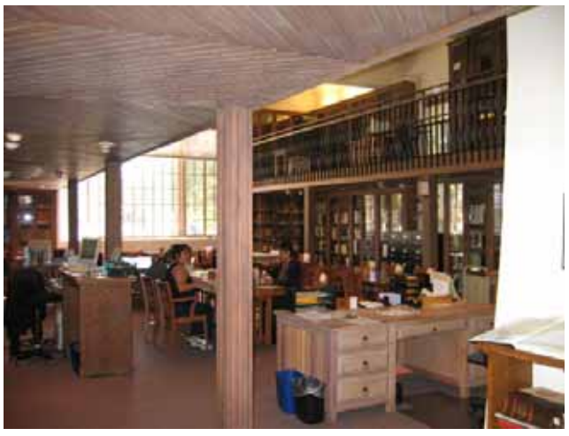
University of New Mexico Library and its Special Collections.