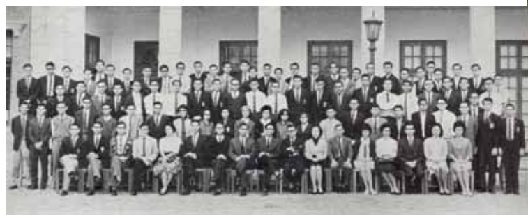
Exhibit of a photograph from Elixir, a Student Medical Society publication

Med Alumni Photo Exhibition 13 - 16 October 2004