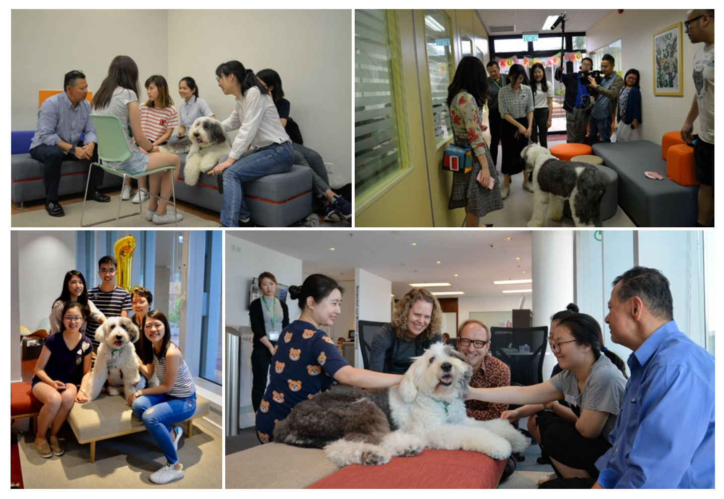
Clockwise: Main Library, Education Library, Music Library and Law Library