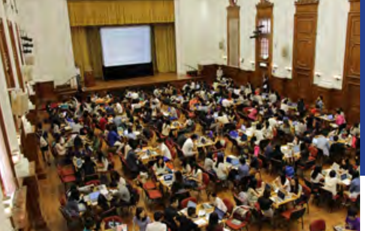
How the class was held in Loke Yew Hall.