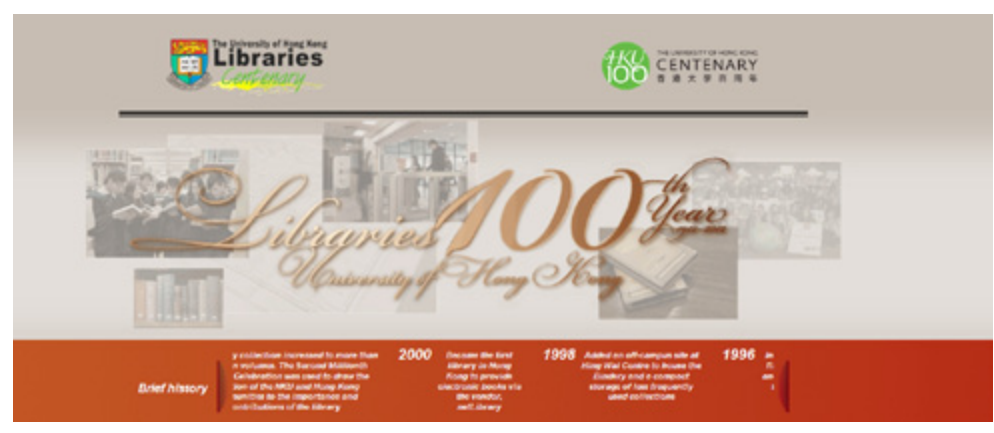
Libraries Centenary Webpage

The Libraries has organized a variety of activities to celebrate its centenary, including book talks, library history exhibitions and sharing of library memories. To re-visit these activities, please click http://lib.hku.hk/hkul100/index.html.