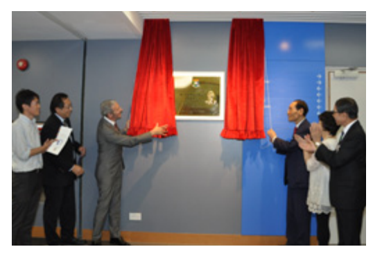
Revealing the Plague