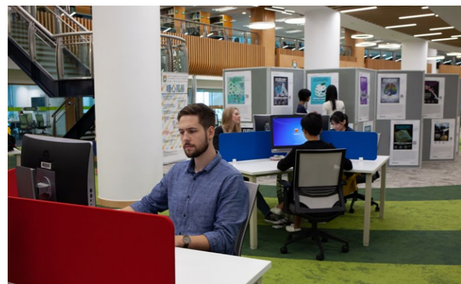
The Technology Zone in the Yu Chun Keung Medical Library provides one-stop shop convenience for learning and research.

The University of Hong Kong Libraries Pokfulam Road, Hong Kong