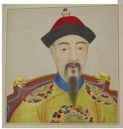
Flowers of Cotton Tree