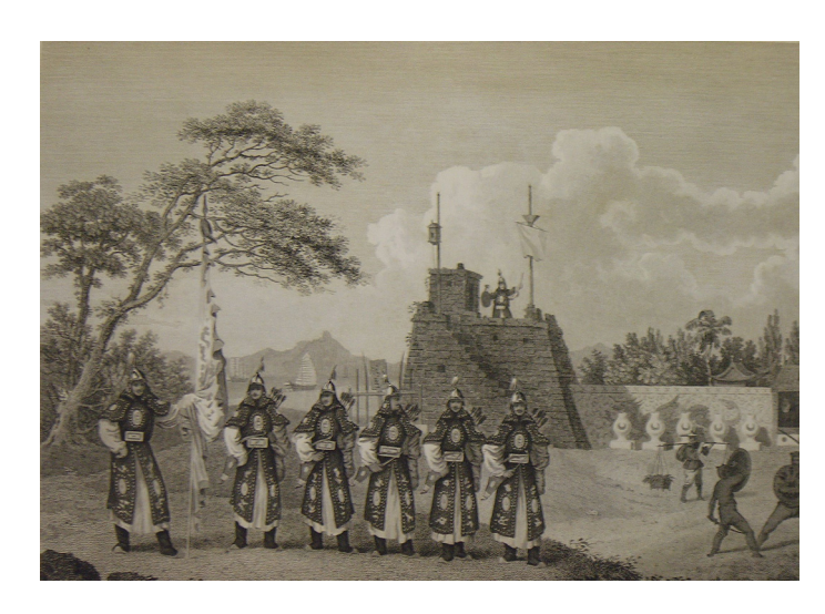
A Chinese Military Post

This five-volume set of gems is kept in a fire-proof safe in the Fung Ping Shan Library. For enquiries, please approach the Special Collections counter.