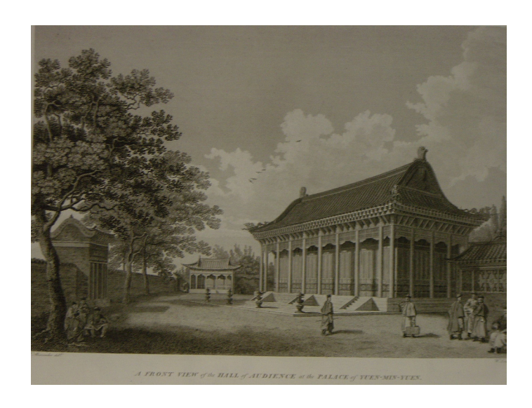
A View of the front of the hall of audience at the palace of Yuen-men-yuen