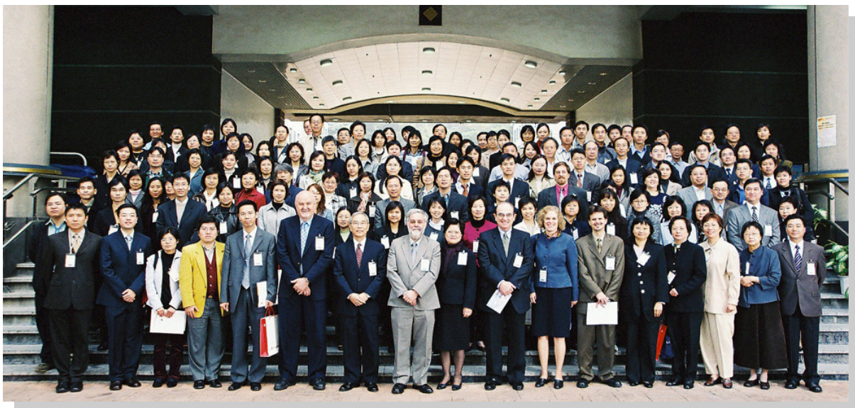
The fourth HKIUG meeting was hosted by the Lingnan University Library