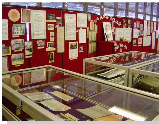
Display of Dr Sun in Main Library

On display were historical information on the establishment of Hong Kong College of Medicine for Chinese, Dr Sun Yat-sen's examination records, his speech and writings, couplets, photos, and a map of the Sun Yat-sen Historical Trial. Response to the Sun Yat-sen Quiz was overwhelming and a total of 231 entries were received. Seventy-five lucky winners each received a copy of the book Guo fu zai Xianggang zhi li shi yi ji (國父在香港之歷史遺蹟) by Luo Xianglin (羅香林).