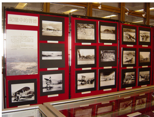
Display of Aviation History in Main Library

The centenary on 17 December 2003 marked the Wright Brothers' first successful sustained, controlled flight in a powered aircraft in Kitty Hawk, North Carolina, USA. The Libraries was pleased to commemorate the 100 th anniversary of flight with this exhibition featuring photographs of Kai Tak Airport, Chek Lap Kok Airport, airplanes, and first-day cover, air tickets, airline bags and other interesting memorabilia. This is complemented with a talk on the history of Kai Tak Airport by Mr Alfred Sung on 18 December.