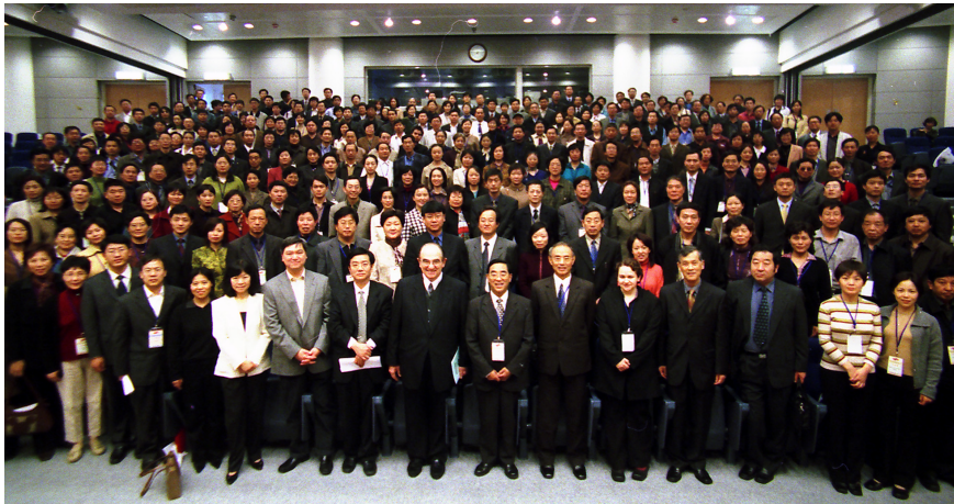
Full house attendance at the International Forum

After the conference lunch, visitors flocked to visit our Medical Library. Our Library staff had the opportunity to show case the library and to give the enthusiastic visitors tours of the facilities and answered an array of questions. Visitors were impressed by the Medical Library and its extensive digital resources.