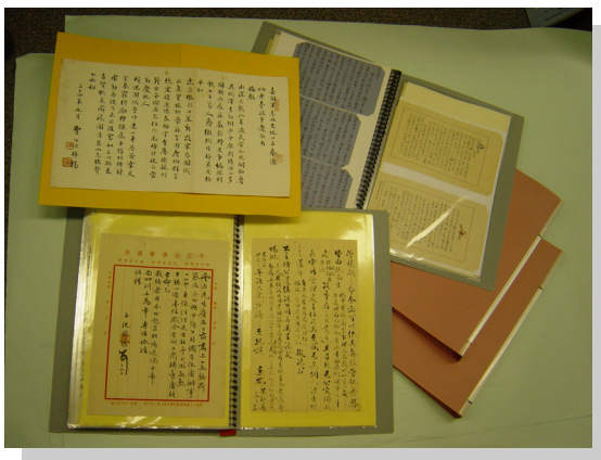
圖二. 清理整頓後, 已把各信件從報中抽出, 安置在文件夾套內。

此集最大的毛病是缺欠首冊及書信內曾言之附件, 如呈文、履歷表、樣稿等, 使「全」集失去了其完整性。書信內多缺註年份, 惟從尊稱「副院長」、「部長」中可推敲其通信的大概時間。另因曾張貼於報章內, 許多信箋的上方仍黏結有報章上的文字或紙塊, 又或有邊角被毀扭摺曲屈, 敝要全部清洗整理, 實在還需一定的日子!