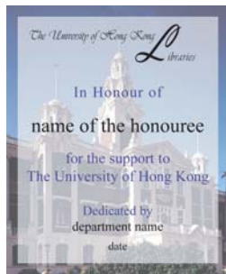
Actual size: 8.2 x 10 cm

Telephone No: _____ Fax: _____ Email: _____